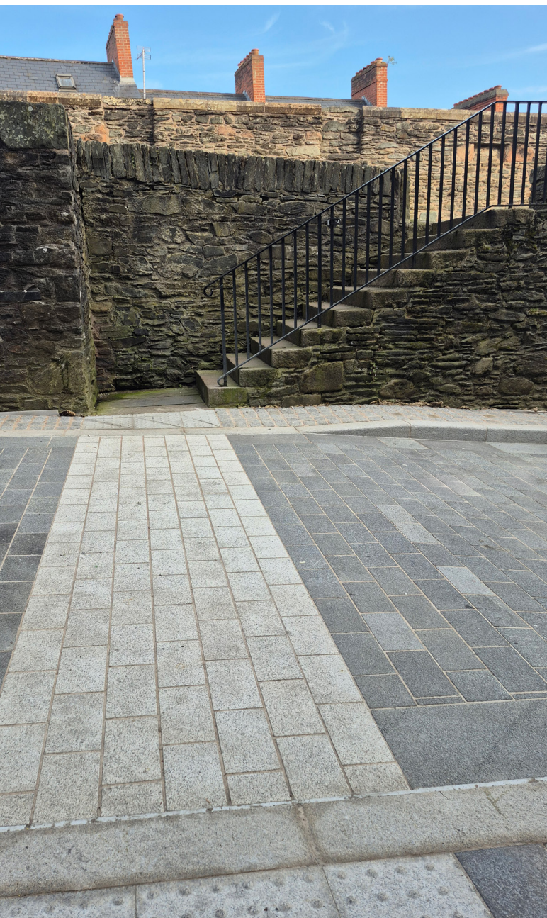
Feature paving at wall access steps