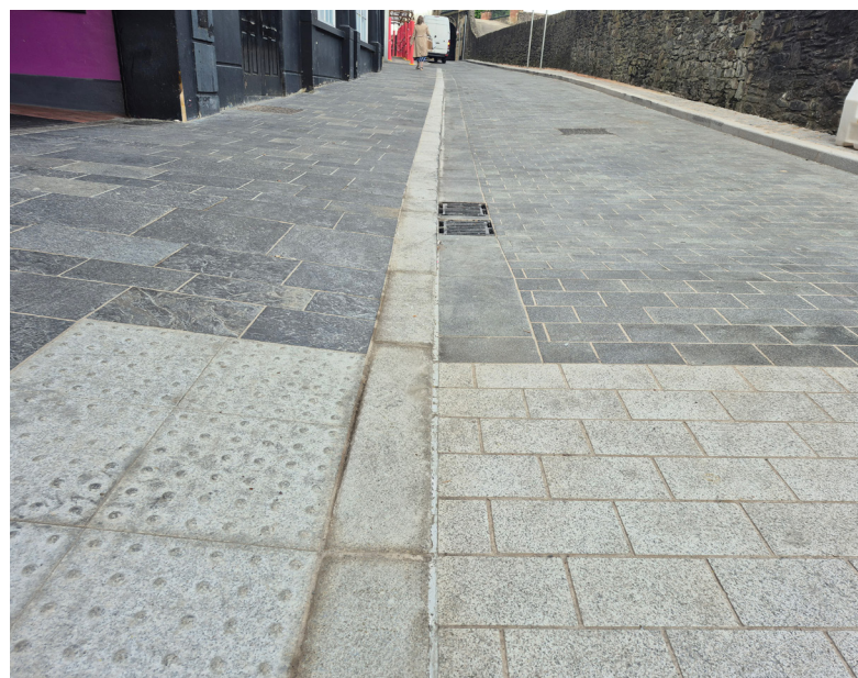
Tactile paving and dropped kerb access