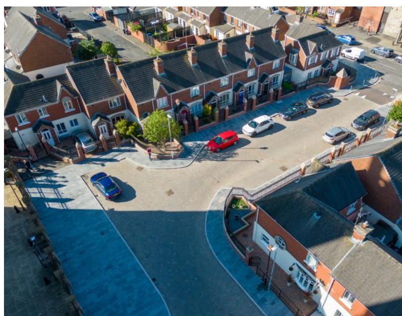
St Peters Close