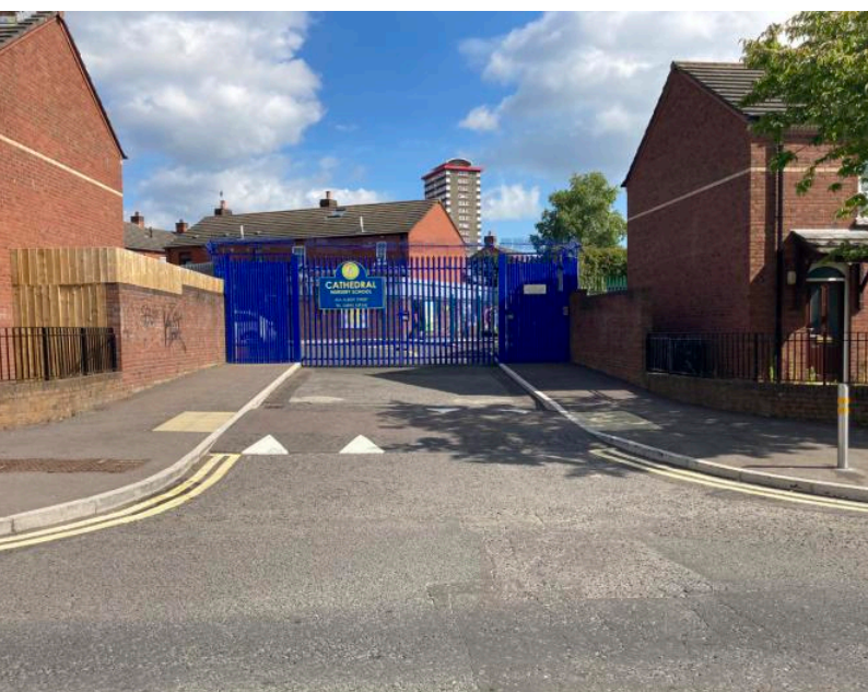
Cathedral Nursery School