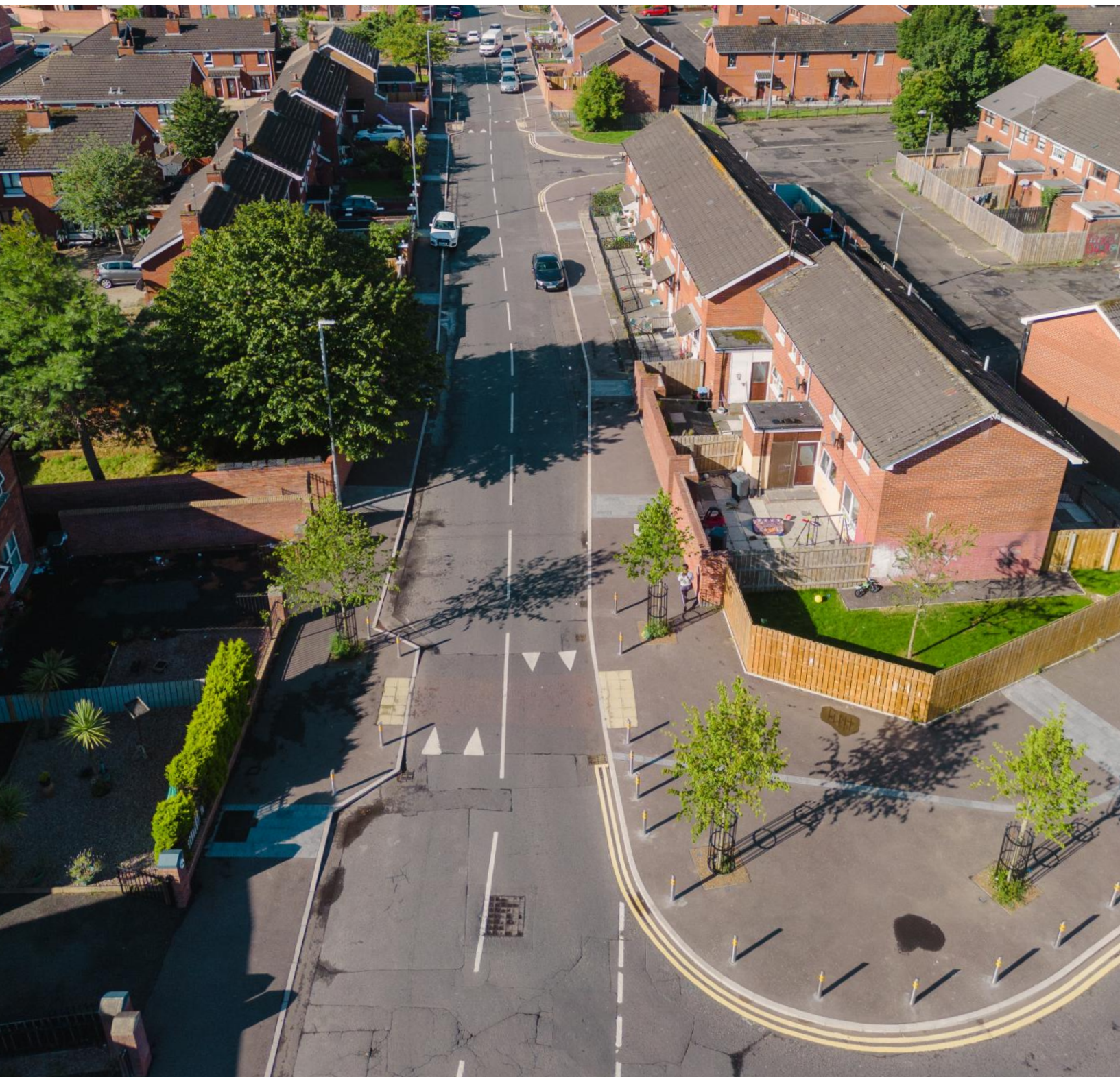
Cullingtree Road Completed Aerial View