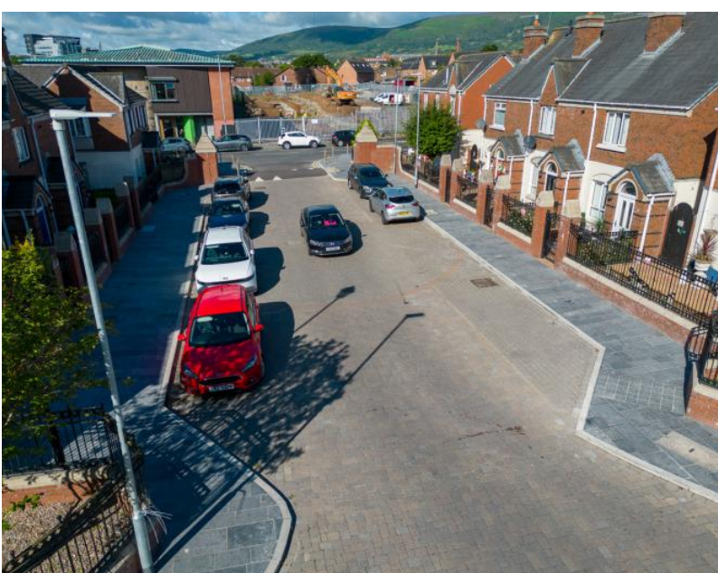
St Peters Close