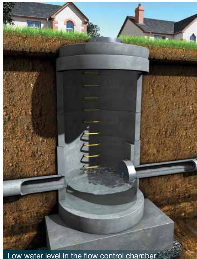
Low water level in the flow control chamber

Vortex flow technology is based on the principle of a vortex hydrodynamics, where under sufficiently high upstream water levels a vortex is induced in the flow by the device. The vortex motion results in significant energy loss, creating a pressure drop across the device and restricting the discharge leaving the outlet. The geometric properties of the device control the amount of flow restriction and can be tailored to suit the design conditions for a specific site.