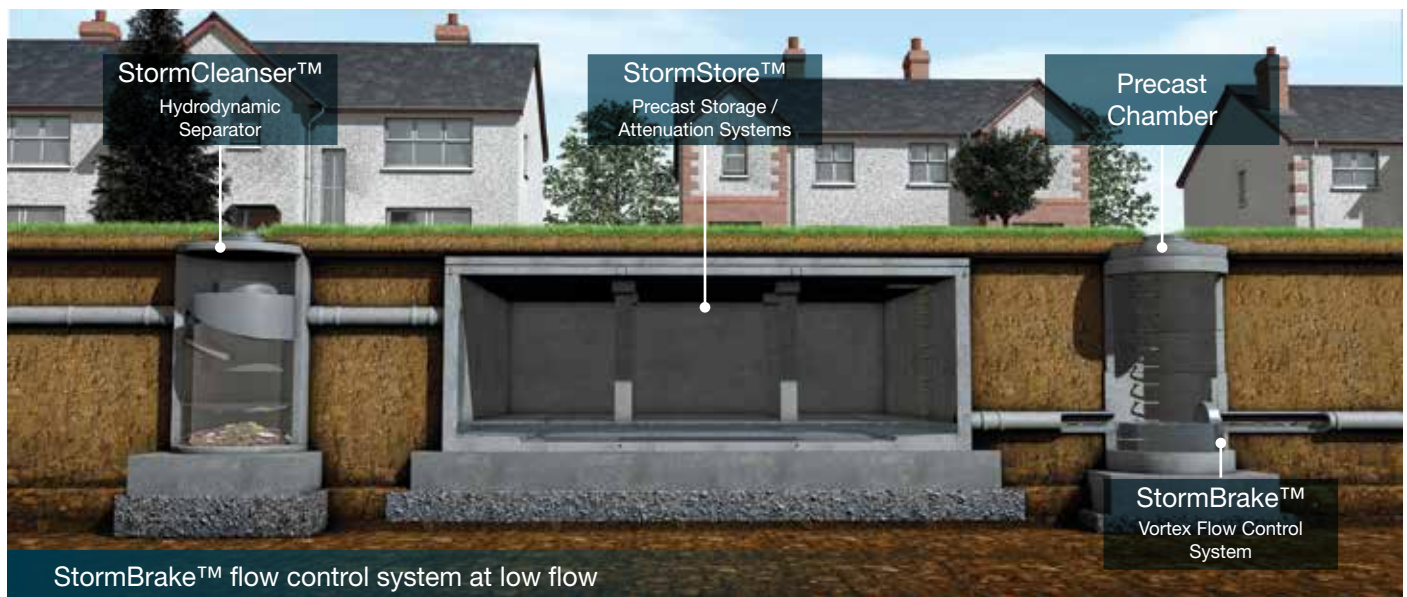
StormBrake™ flow control system at low flow