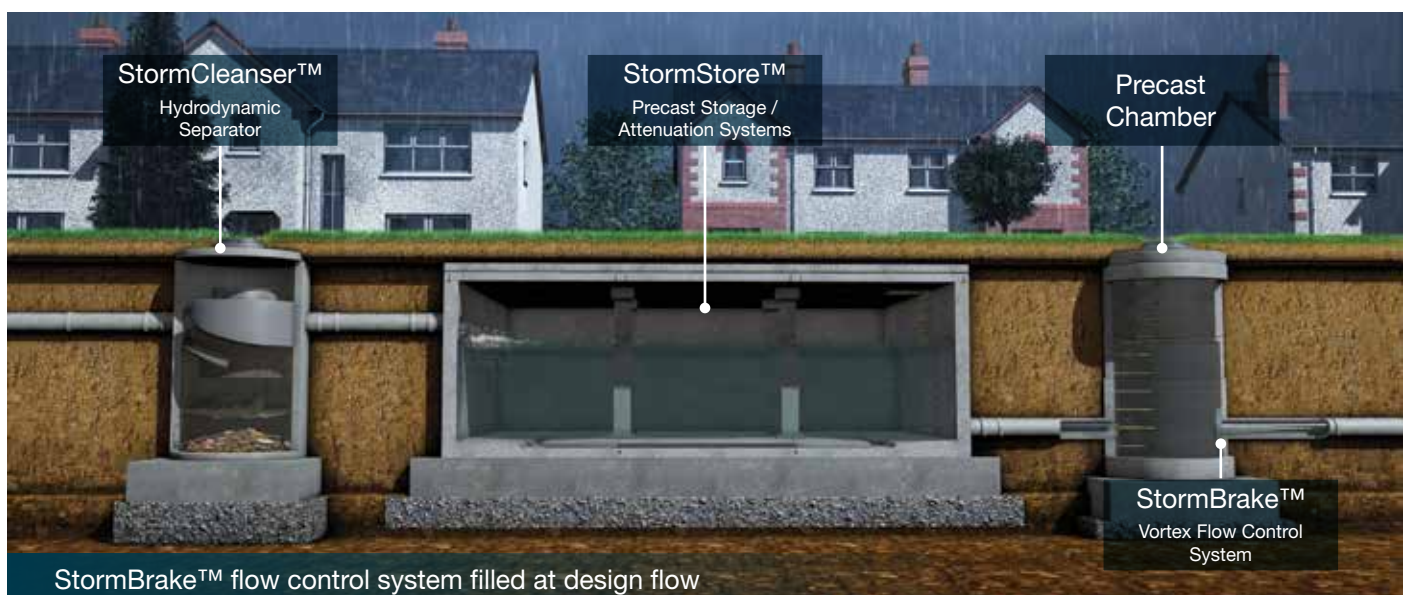
StormBrake™ flow control system filled at design flow