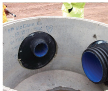
Once pipe is fitted to connector, up to 45° of deflection is possible without breaking the seal.