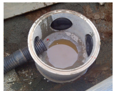
Can be used in straight through, 90° connection or straight through with a cross drain.