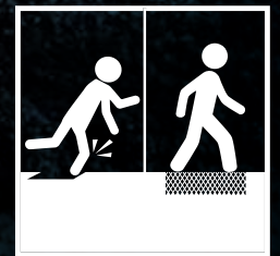
TRIP PREVENTION REPAIR