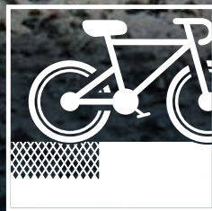
CYCLE WAY REPAIR