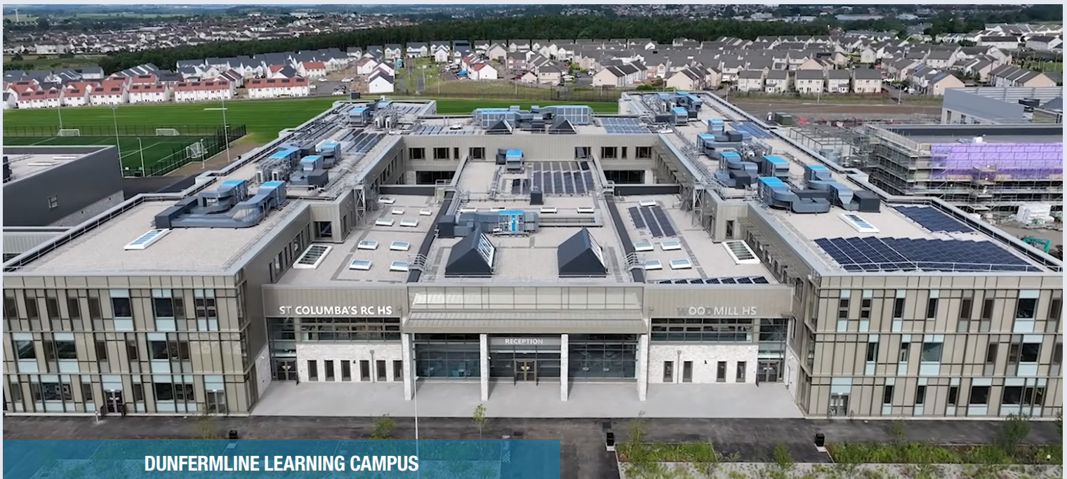
DUNFERMLINE LEARNING CAMPUS