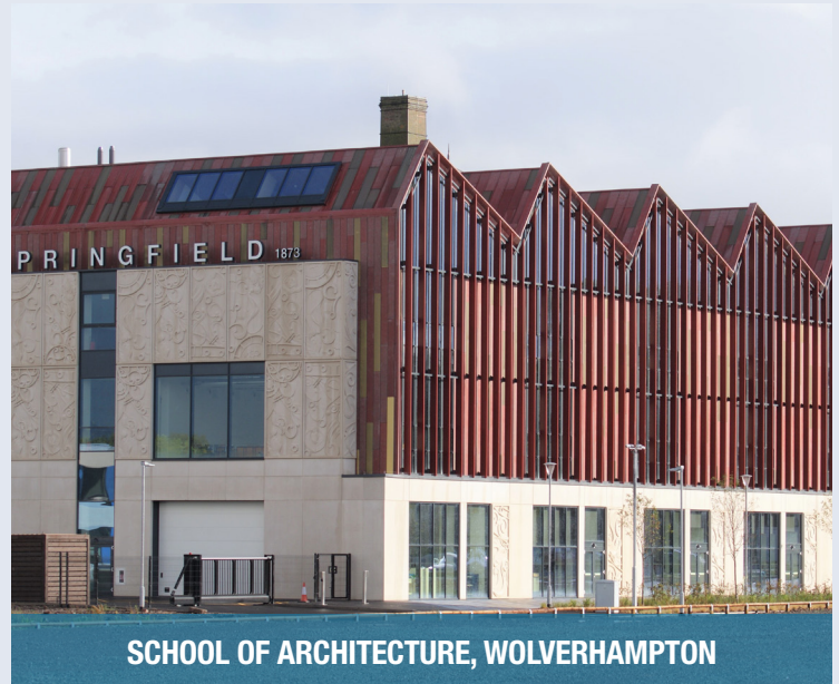
SCHOOL OF ARCHITECTURE, WOLVERHAMPTON