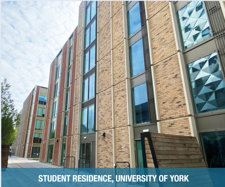
STUDENT RESIDENCE, UNIVERSITY OF YORK