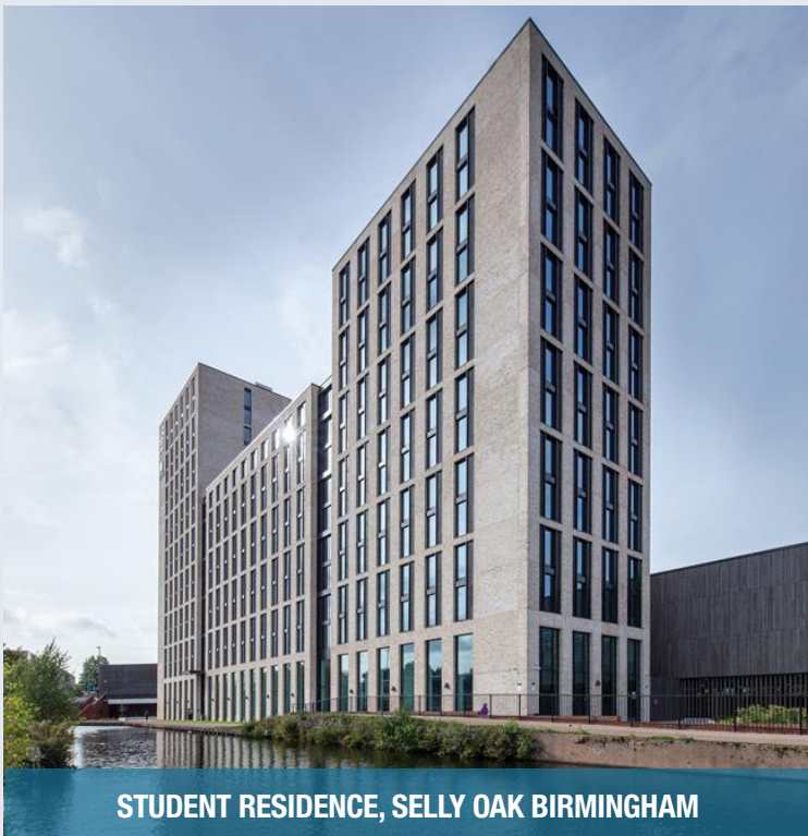
STUDENT RESIDENCE, SELLY OAK BIRMINGHAM