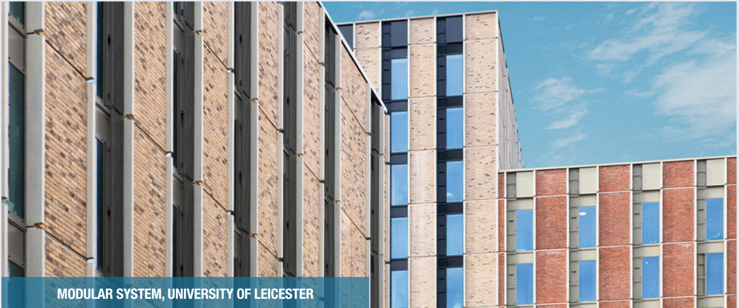
MODULAR SYSTEM, UNIVERSITY OF LEICESTER