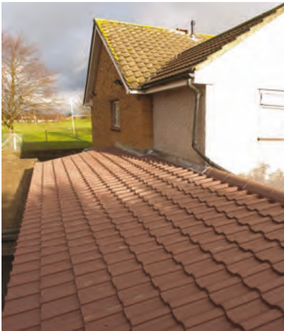
Red Centurion on a private house extension in Speedwell, Bristol.